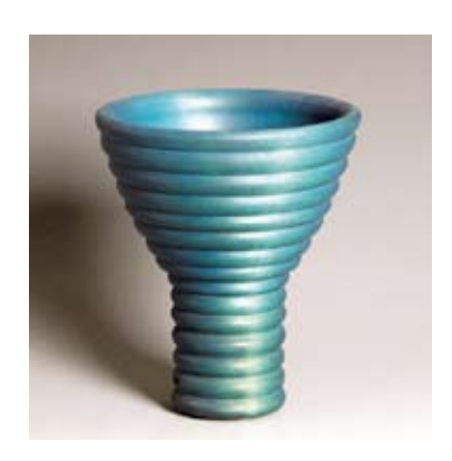
Maple Bowl, dyed